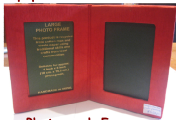
Photograph Frames The perfect way to display your festive photographs