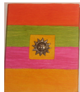
Sunshine Notebook Delightfully colourful notebooks perfect size to fit in your handbag or as an extra gift